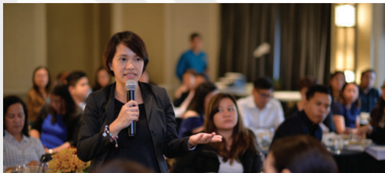
A GMM 5 participant articulating her question during the Q&A, with the audience attentively listening in the background.