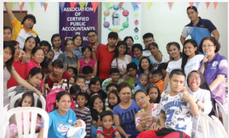
The ACPACI team with the special children of the Sisters of St. Francis Xavier and their parents and siblings.

Some kids showcased their talents; some sang, some danced, and the others prepared a skit and acted. As if divinely inspired, the parents joined