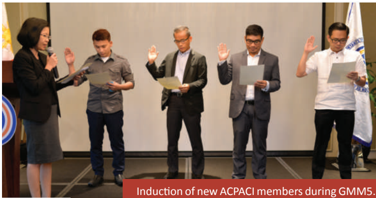
Induction of new ACPACI members during GMM5.