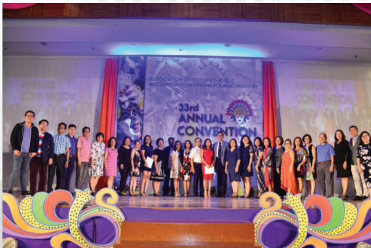
Another "picture, picture" moment of the ACPACI Officers and directors with some delegates and guests at the 33rd ANC.

After two days of steady dose of technical sessions, the conference goers had a day of respite and relaxation. Early in the morning, there was a zumba session at the hotel's poolside, then after breakfast, the delegates boarded on three Merzci buses for a rolling tour around Bacolod City. They saw the Provincial Capitol Building and marvelled