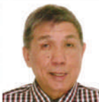
Julian M. Tecson Annual Convention