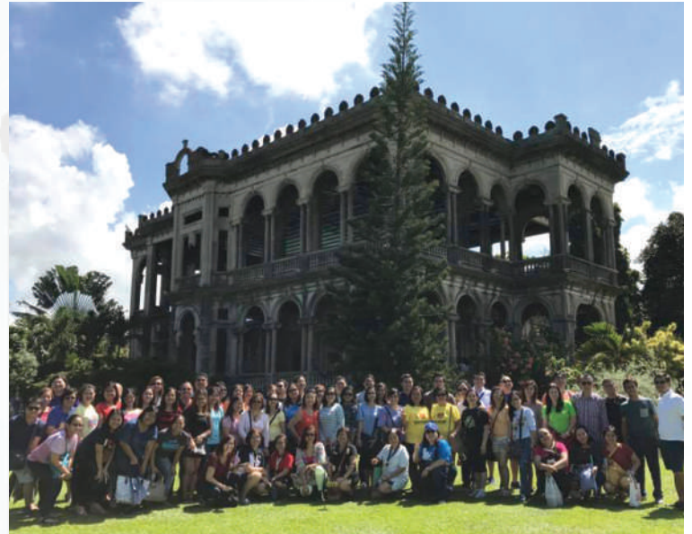
Group picture with the resplendent The Ruins in the backdrop. After two days of back-to-back conference sessions, the ANC delegates took a much needed respite. They toured some parts of Bacolod City, Mambukal and The Ruins.

at its Neo-Roman architecture as well as the nearby Capitol Park and Lagoon and had a glimpsed of its two golden carabao installation on each side of the lagoon. The main destination was The Ruins, a former stately mansion but burned down during World War II; it symbolizes the undying love of a husband to his wife who died of child birth, and is also known as the Taj Mahal of Negros. It is one of the top tourist spots in Negros. On the way to the Ruins, the delegates were greeted by vast swathes of sugarcane plantations, a hint of the city's rich history and culture. The Ruins was majestic and breathtaking. The mansion maybe antiquated but the grass, pine trees, gardens, the fountain and the surroundings were well-maintained, and there was plethora of chandeliers of different sizes and designs hanging from the ceiling; it was something unexpected.