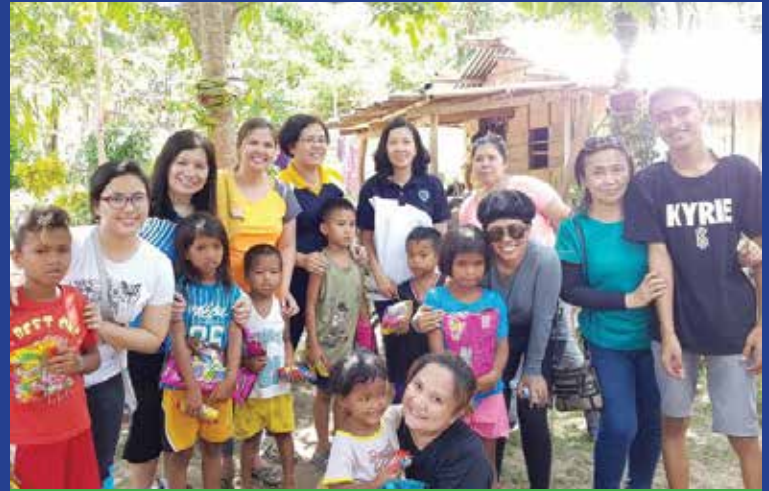
ACPACI officers and volunteers sharing light moments together with the Dumagat children.

Though tired, the hikers quickly set up the cornucopia of goods, school supplies and slippers they brought for the Dumagats. Some of the volunteers