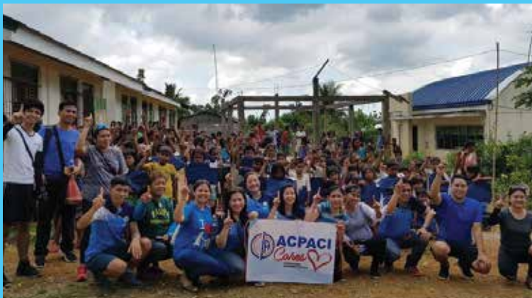
ACPACI Cares tarpaulin is proudly displayed by ACPACI officers, members and volunteers, together with Climb Against Cancer Pilipinas, during the outreach program for the Mangyan community in Mindoro.

The second social involvement activity lined up by ACPACI entailed taking a two-hour bus ride from the ACPACI members' meeting point to the Batangas pier; getting into a fast craft ferry going to Calapan City, Oriental Mindoro; renting a jeepney to bring the volunteers to a remote school in Balite, Naujan and taking a 15 to 20-minute walk under the scorching heat of the sun. The intense heat made their journey uncomfortable, but it was one that they were willing to take. At 5 o'clock in the morning on June 24, 2017, ACPACI members departed from Metro Manila to bring school