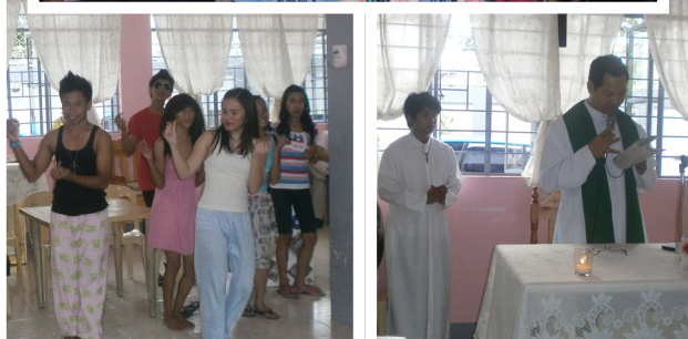
Prisoners Week Awareness Program October 1, 2012 | Camp Caringal, QC