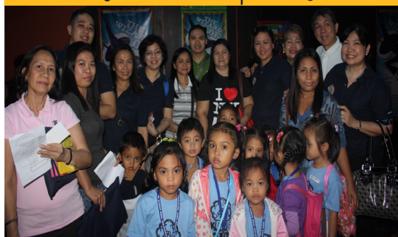
Repertory Phils. - Wizard of Oz August 18, 2012 | OnStage