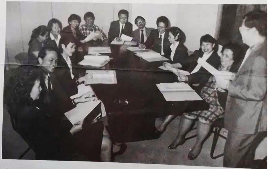
The Board and Chairmen at the blessing.

This year's conference presents a package of the success factors that make for an accountant ready to not only face but walk the 90's.