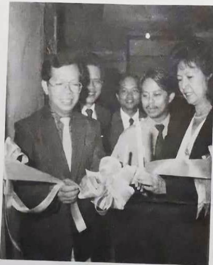
Cutting the ribbon.